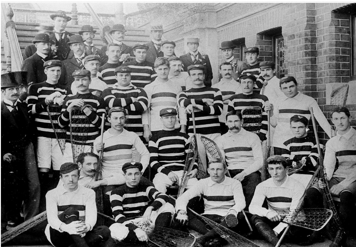
Victorian and South Australian Lacrosse Teams - 1898 Interstate Match played on Melbourne Cricket Ground 6th August - Victoria 9 def South Australia 5

Through the co-operation of Melbourne University, several of the university players, previously unavailable, were able to make the trip, and the visit of the South Australian team to Victoria was duly made. Each colonial association selected a team from such players as were available, the Victorian selectors suffering the adverse comment with which ambitious players usually reward selectors.