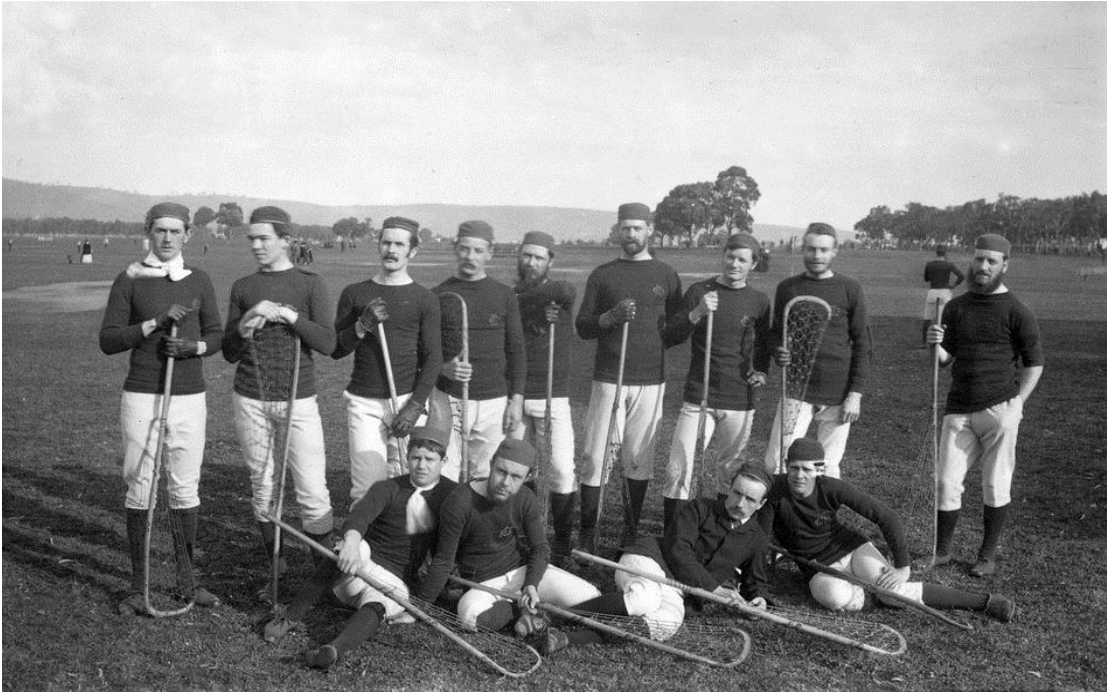
Above is the Adelaide team and below is the Noarlunga team. Nobel prize winner in physics, Professor Bragg is third from the left in the back row of the above photo. Professor Bragg shared the prize with his son in 1915, both lectured at the University of Adelaide.