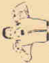
ALLEGEDLY DANGEROUS IN THE GOAL