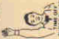
THREE BLASTS WHISTLE