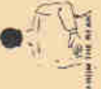
PULLING THE NET