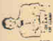
STOP PLAY OR GOAL