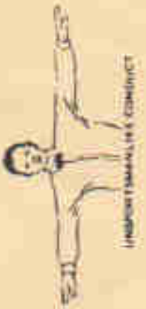
HAND OR ARM RAISED TO OBSTRUCT