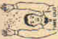
ONE LONG WHISTLE BLAST