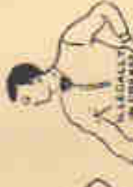
ALLEGEDLY DANGEROUS IN PENALTY AREA