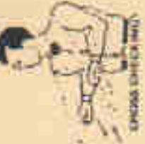
SPINNING OR CHECKING