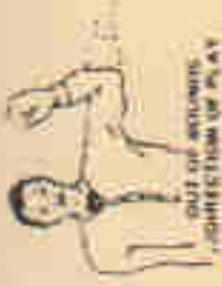
CALL OF MINUTES, RESUMPTION OF PLAY