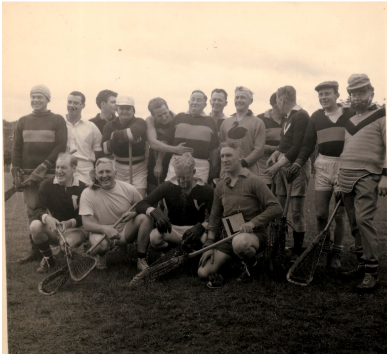
Above are the players from a 1961 Williamstown masters game.