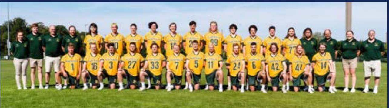
U21 MEN'S WORLD CHAMPIONSHIP TEAM FOURTH PLACE