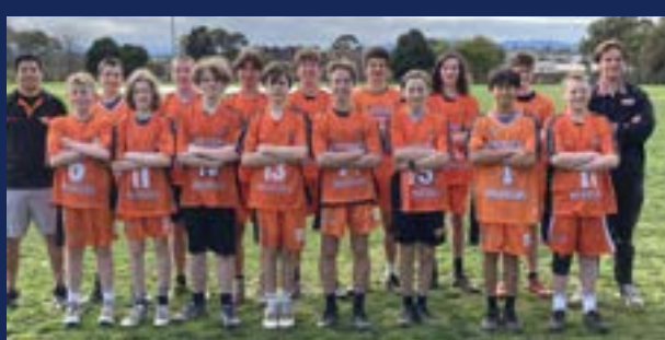
NORTHERN WARRIORS SEVENTH PLACE