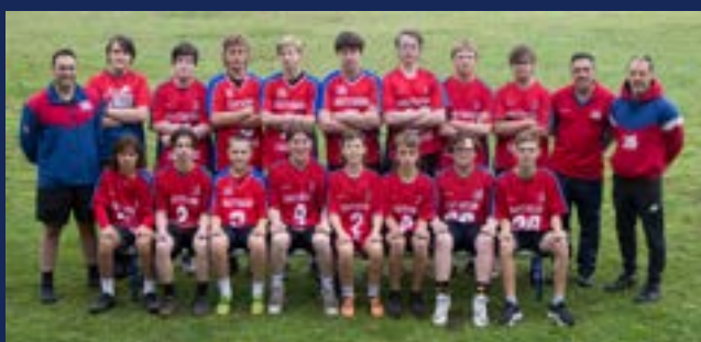
SOUTHERN CROSSE THIRD PLACE