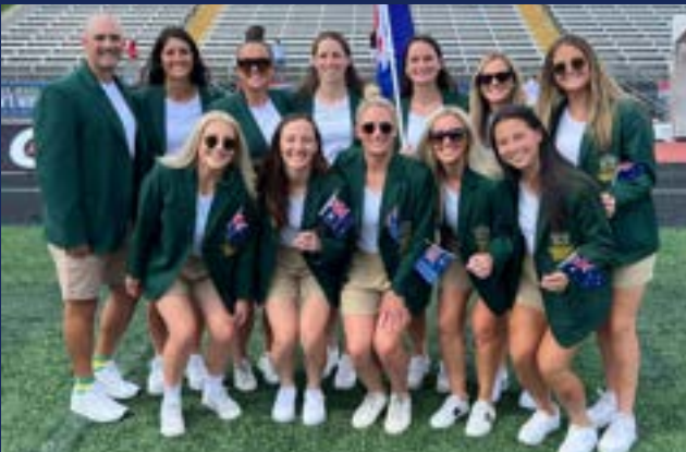
WOMEN'S WORLD CHAMPIONSHIP TEAM FOURTH PLACE