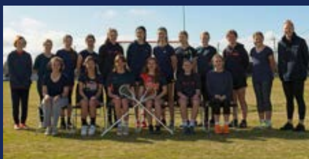
ICE FIFTH PLACE