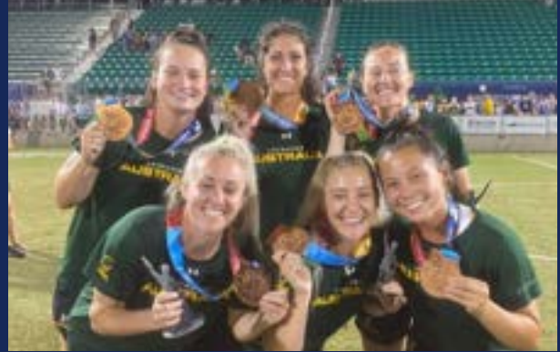
WOMEN'S WORLD GAMES TEAM BRONZE MEDALLISTS