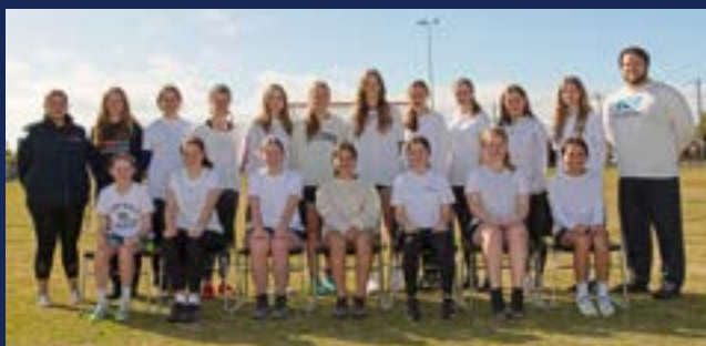
FIRE THIRD PLACE