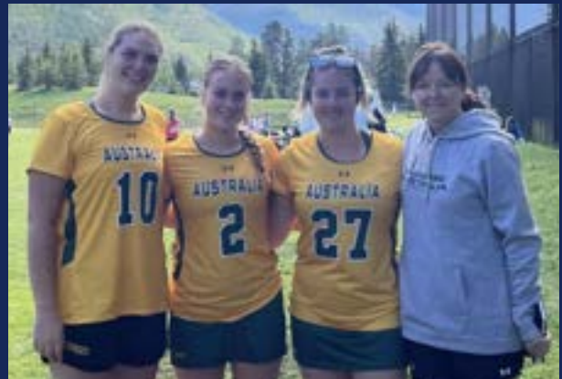
U23 WOMEN'S TOURING TEAM