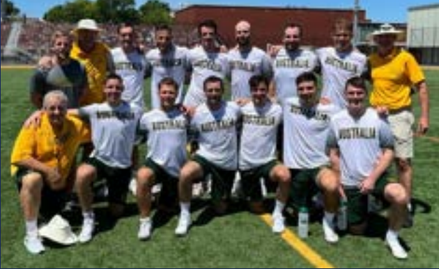
MEN'S WORLD GAMES TEAM SIXTH PLACE