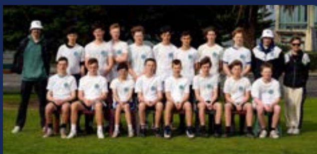
WESTERN METROS SIXTH PLACE