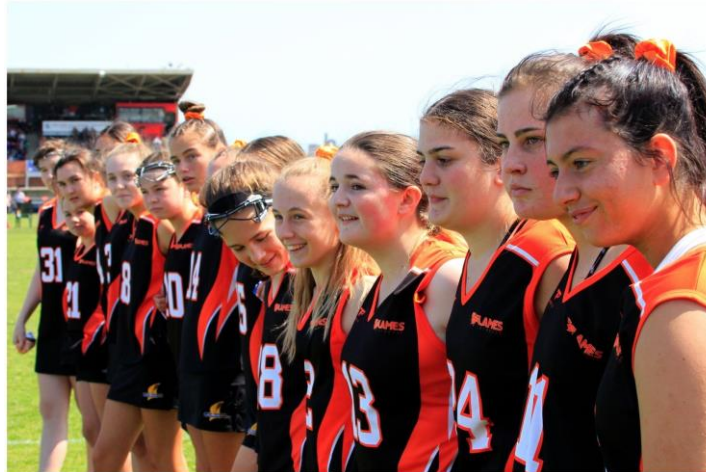
2019 WA U15 Girl's Flames Team – Grand Finalists