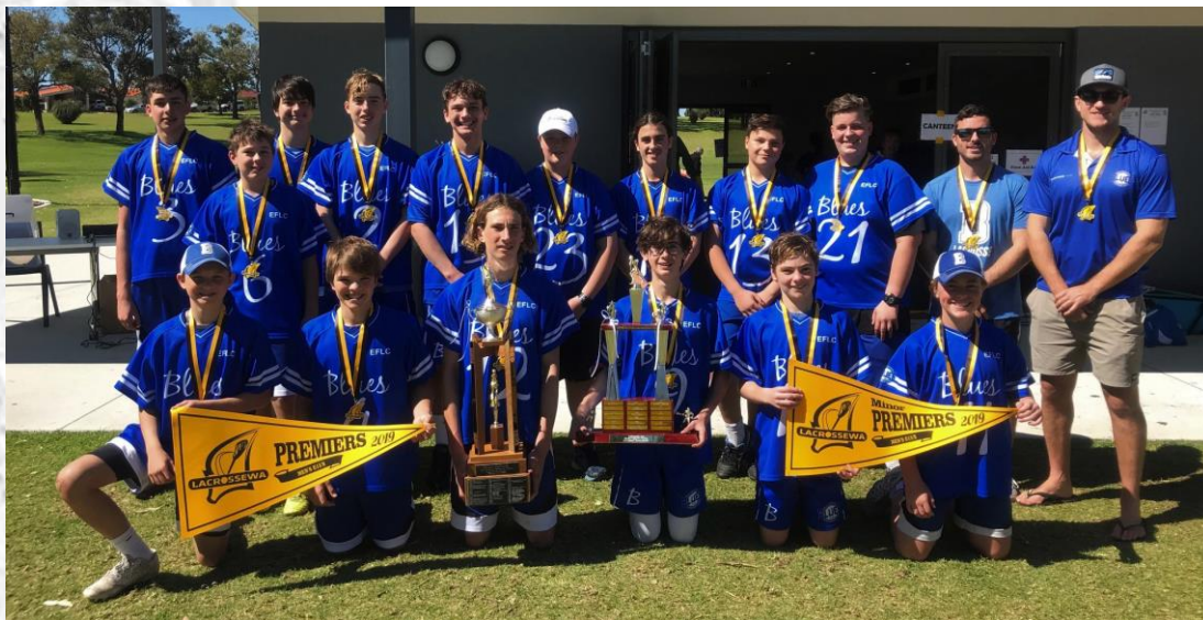
2019 Boy's U15's Premiership Team – East Fremantle

Brian Griffin Trophy Rob Taylor Trophy Steve Mounsey Trophy