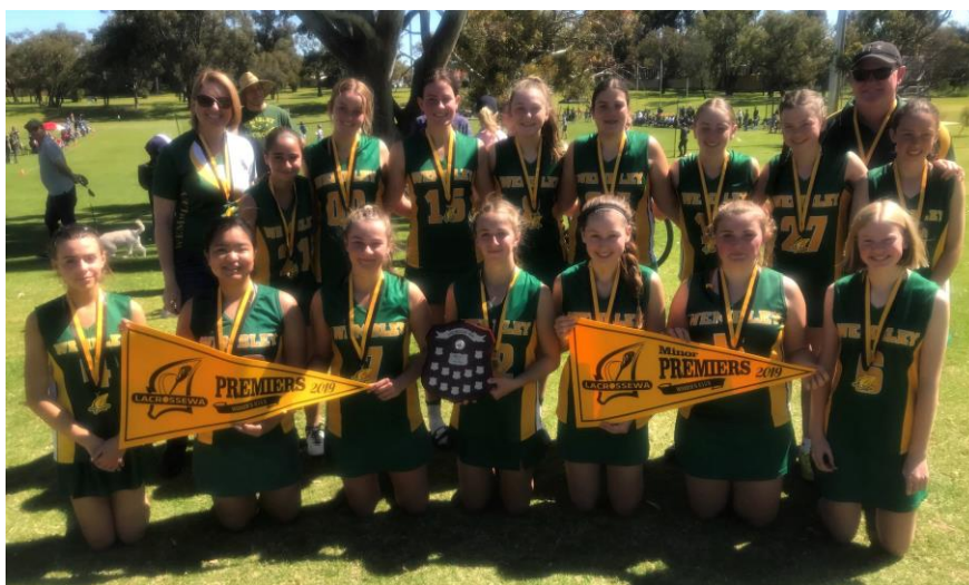
2019 Girl's U15's Premiership Team – Wembley