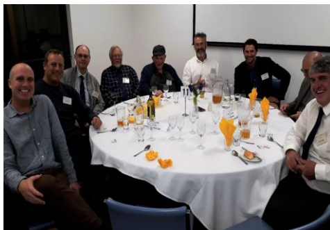
Kuljak Annual Dinner – Subiaco table