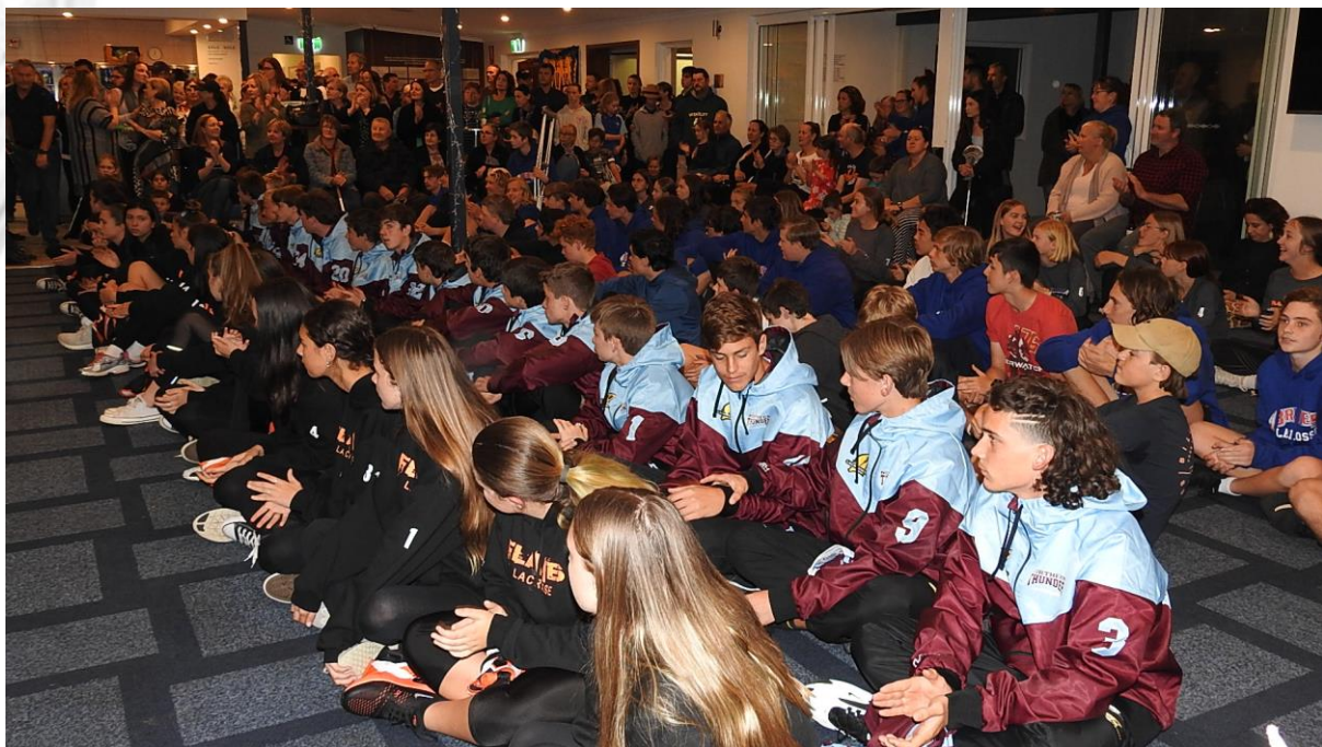
2019 LWA U15 Regional Teams Uniform Presentation

Lacrosse WA still has a number of challenges ahead, but the more involvement we get from the local lacrosse community, the easier these challenges will be accomplished and this will only strengthen lacrosse in WA.