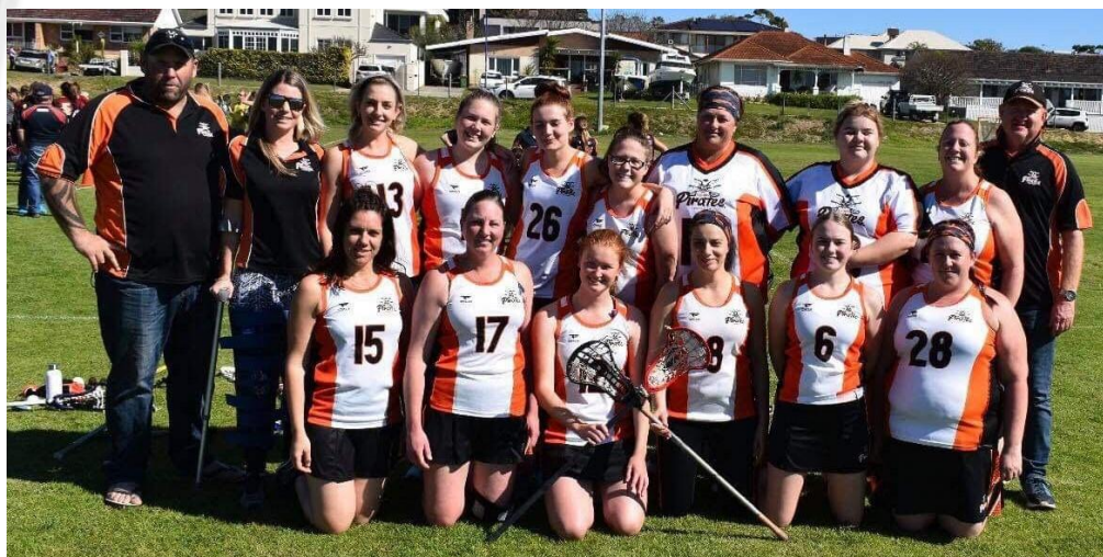
2019 Alkimos "Pirates" Women's Division 2

Unfortunately due to a clash with ground bookings with the local football clubs, we were unable to obtain our field for the women's games on Sundays. Simon thought outside the box and approached St James Anglican School, booking in our 3 allocated dates on the schools oval. It was quite an ordeal moving all the gear each of these days and then having the crew able to handle operations all day until pack up. I think the days ran relatively smoothly and we learnt how to improve on each occasion, so thanks to all those that came and participated on those days. 2020 will hopefully bring an easier opportunity to host the women's games at home for us.