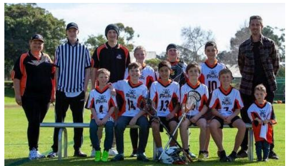
2019 Alkimos "Pirates" Men's U13's Team