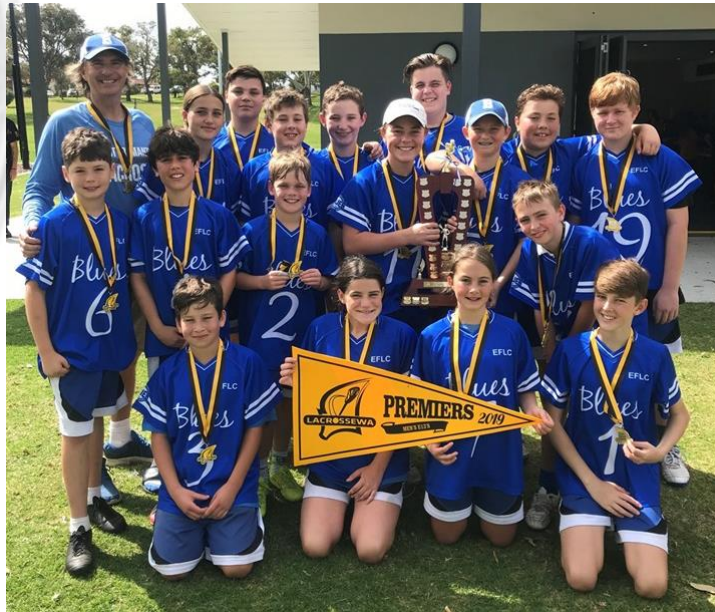
2019 Boy's U13's Premiership Team – East Fremantle

Premiers Trophy Minor Premier's Trophy Murray Keen Trophy