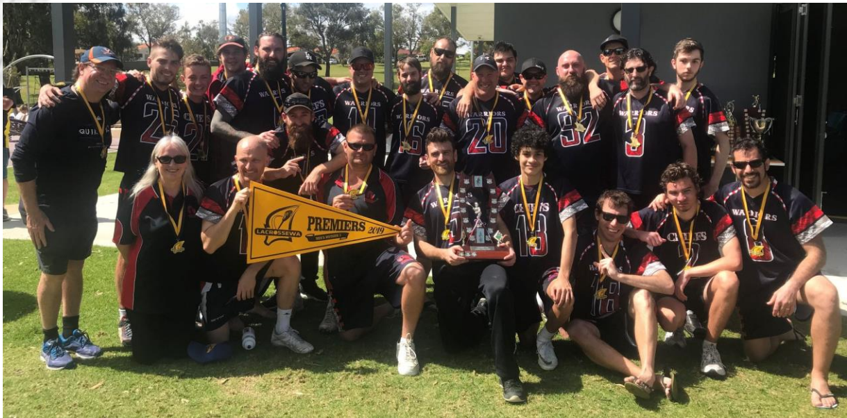
2019 Men's Division 3 Premiership Team – Wanneroo-Joondalup

WA Lacrosse Assoc. Trophy Lloyd Paul Perpetual Trophy Keenscreen Brine Trophy