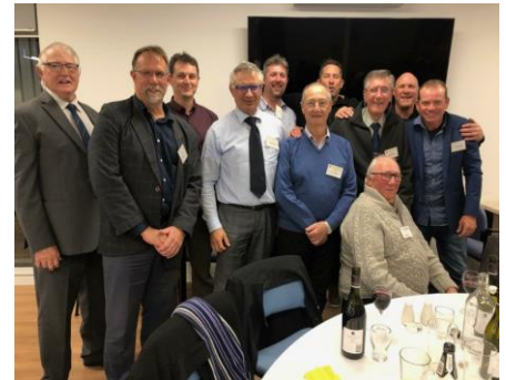
Kuljak Annual Dinner – East Fremantle table

This year Kuljak approved a donation of $500 to each club with junior teams to be used towards their Junior Development.