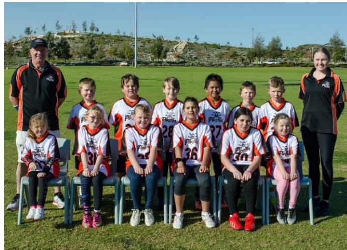
2019 Alkimos "Pirates" inaugural Men's U11's Team

Congratulations to all our clubs, teams, players, staff and supporters. The game needs you, we exist because of all the hard work that is put in by our club members.