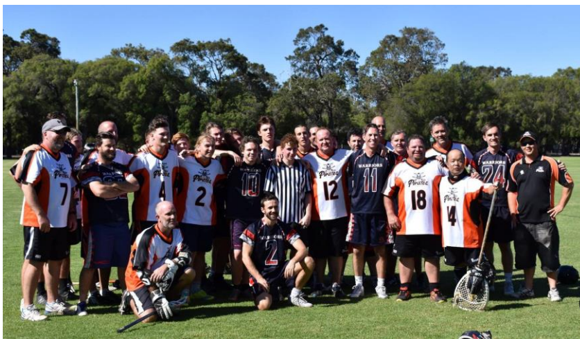
2019 Alkimos "Pirates" - 2019 South West Lacrosse Tournament - Busselton