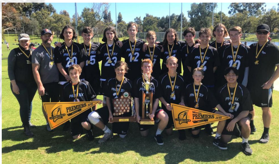
2019 Boy's U17's Premiership Team - Phoenix

Ramsay Trophy Greg Wheatley Trophy Jeff Kennedy Trophy