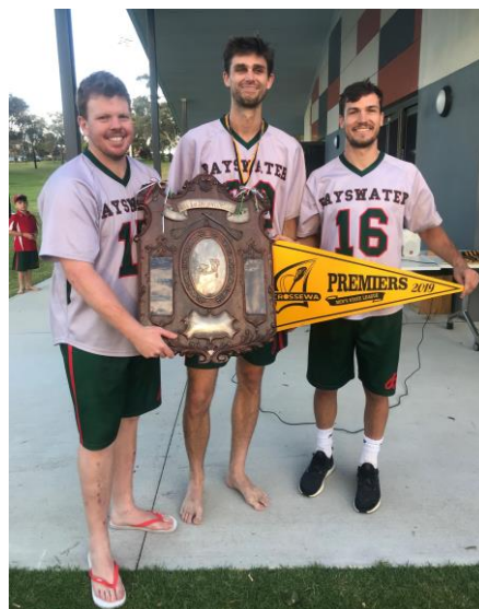
Bayswater State League Captains – 2019 Premiers and Minor Premiers