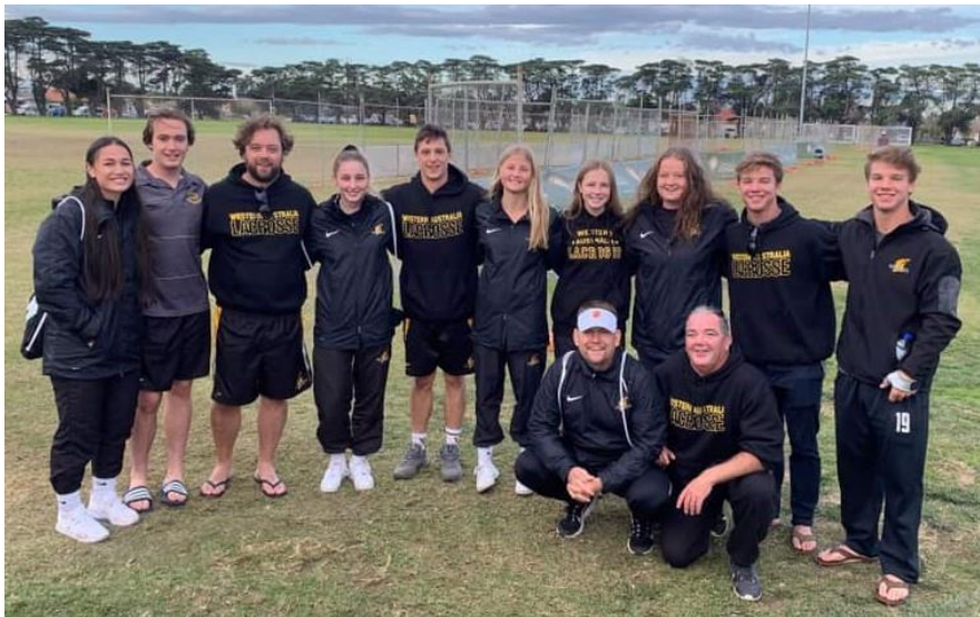
2019 Subiaco Senior State Team representatives