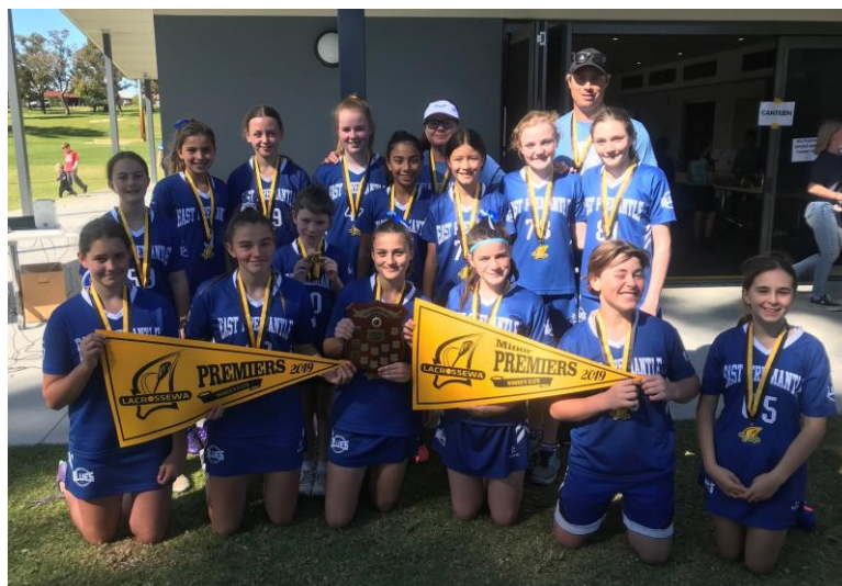
2019 Girl's U13's Premiership Team – East Fremantle