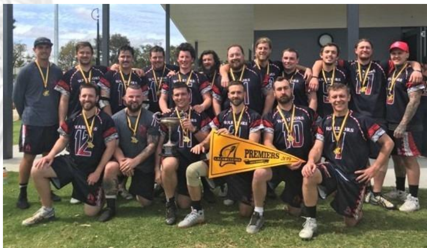
2019 Men's Division 2 Premiers - Wanneroo-Joondalup Blue

Jubilee Trophy Clarke Cup Morris & Scott Trophy Cyrill Allman Medal