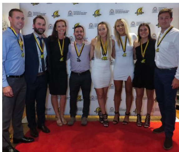
East Fremantle State League players in the 2019 LWA All Star Team