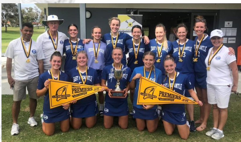
2019 Women's State League Premiers – East Fremantle

LWA Rae Reid Cup Kuljak Medal Sarah Forbes Trophy