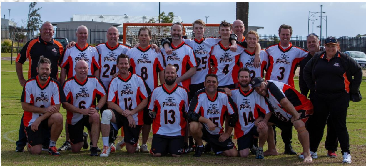
2019 Alkimos "Pirates" Men's Division 3

One thing we find has really boosted the club is our combined training sessions. We run women's and men's training sessions at the same time, and will often have drills involving both teams. Our feedback has been really positive, and this coupled with the large number of new players coming on board, translates into a tightknit and supportive group- with a little bit of friendly competition between players.