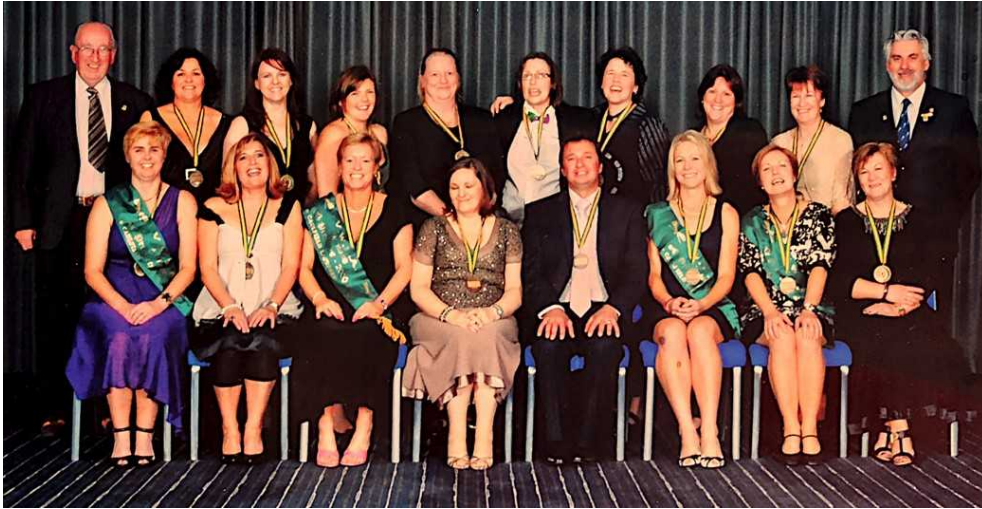
WOMEN'S CENTURY LACROSSE TEAM (1909-2009)