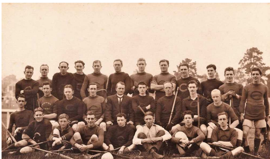
Caulfield team circa 1909