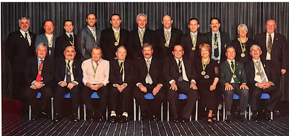
MEN'S CENTURY LACROSSE TEAM (1909-2009)

Since COVID, Caulfield has only been able to field combined junior and senior teams with other Eastside clubs and in 2022 the combined Chadstone and Caulfield senior team won the B grade grand final with a golden goal in overtime.