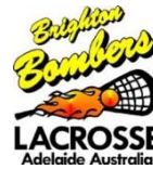
BRIGHTON LACROSSE CLUB