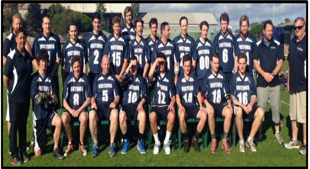
Under 18 Boy's State Team