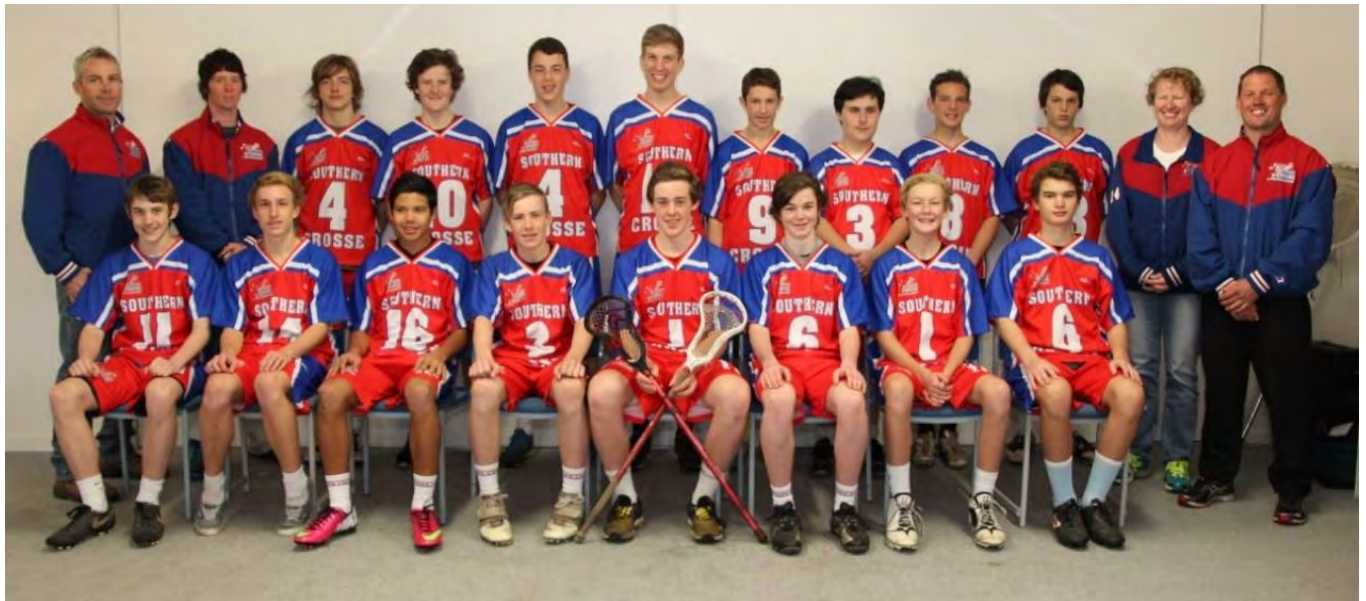
2014 Under 15 Western Metros Team