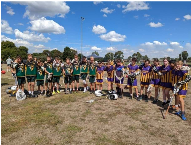
Woodville & Ballarat Royals junior players from 2023 At Ballarat