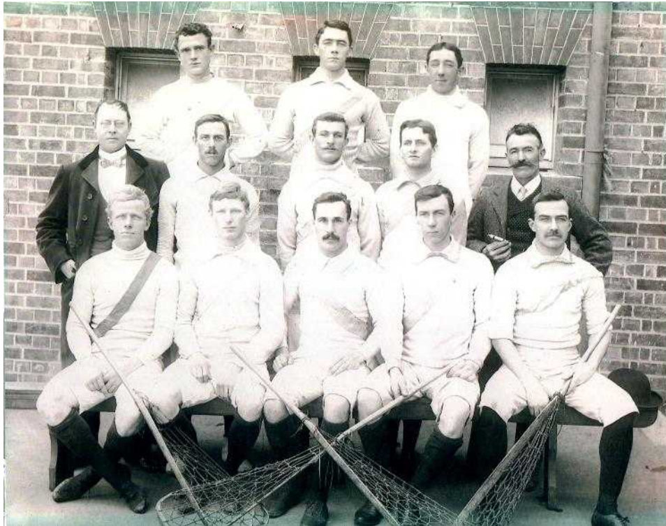
Men's A Grade Premiers, 1904

With the introduction of “electorate” lacrosse in 1903, requiring lacrosse players to represent the team tied to the district in which they lived, Woodville changed the name of the club to Port Adelaide Lacrosse Club to reflect the district from which players were drawn. Success followed soon after, with Port Adelaide (with the assistance of several members of the Holdfast Bay Lacrosse Club) securing the SALAA Grade premiership in 1904.