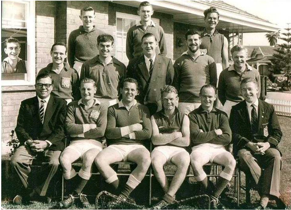
Men's A Grade Premiers, 1959

With the Woodville Football Club's imminent inclusion into the SANFL, the Woodville Oval ground was no longer available to the PADLC. Woodville Council found a ground for the club at Matheson Reserve in Findon from the 1967 season, in which the club was also renamed back to the Woodville Lacrosse Club.