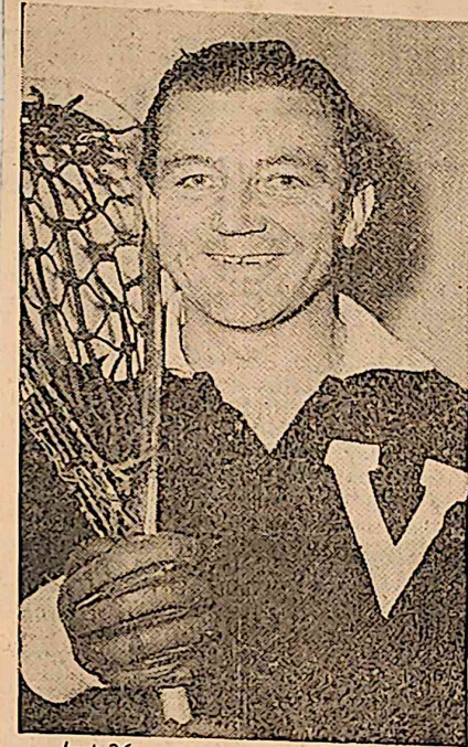
Just 26 years ago, a small boy with an oversized lacrosse racquet ran out on to the Malvern oval to try his hand at a game he knew very little about.

Next Saturday the same player will run out again with the Malvern players to start his 27th season of lacrosse.