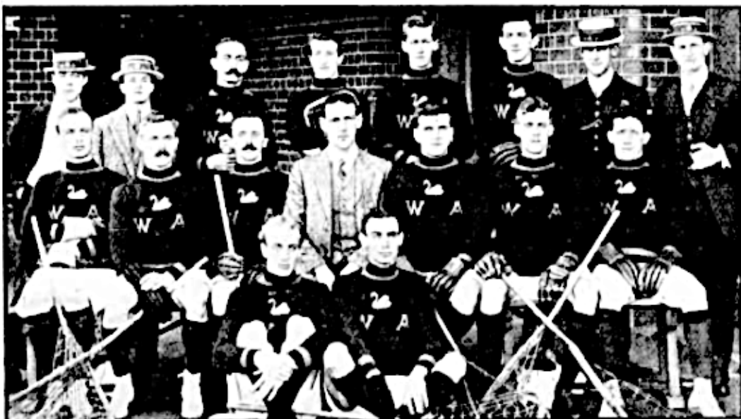
West Australian Team.