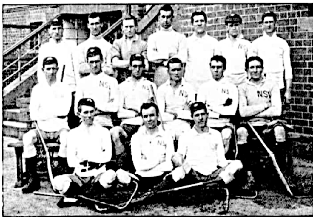
New South Wales Team.