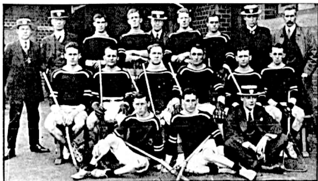
South Australian Team.

results were:—West Australia beat Tasmania by 14 goals to 2. N.S.W. defeated Queensland 13 to 12. Victoria beat N.S.W. 20 to 3. South Australia beat Tasmania 27 to 2. West Australia beat Queensland 19 to 6. South Australia beat N.S.W. 14 to 1. Victoria beat Tasmania by 22 to 2. South Australia beat Queensland by 19 to 6. N.S.W. beat Tasmania by 7 to 3. Victoria beat West Australia by 13 to 2. South Australia beat West Australia by 15 to 4. Queensland beat Tasmania by 17 to 5. N.S.W. beat West Australia by 19 to 7, and Victoria beat Queensland by 16 to 2. The Victorians were not defeated once and they scored 82 goals to 19. South Australia secured second place and N.S.W. was third.