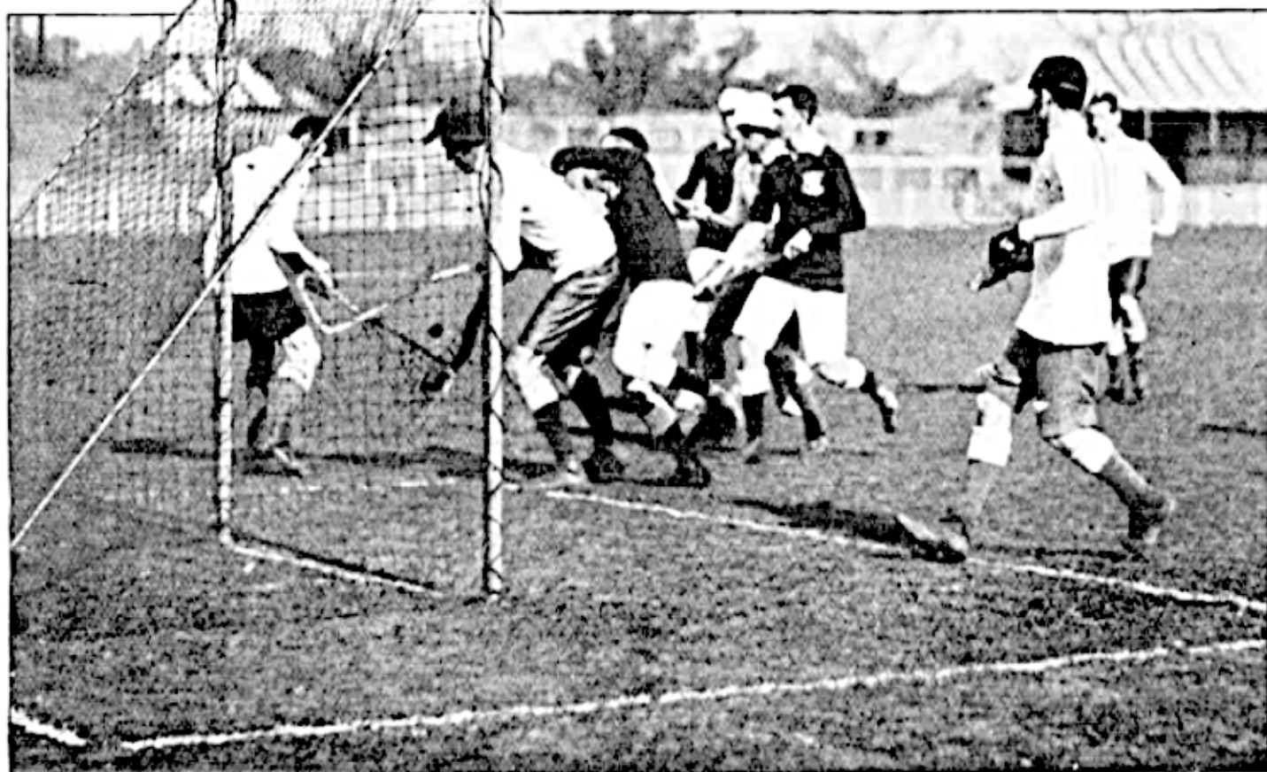
An Incident in the Queensland and New South Wales Match.

Lacrosse is making steady progress in Australia, and enthusiasts in Melbourne were given a treat last week. A carnival was held in the southern capital, and the whole of the Australian States were represented. Never before had there been such a gathering of lacrosse players in the Commonwealth, and considerable enthusiasm was displayed. Unfortunately the weather was not favorable for all the contests. The Victorians, who won the Australian championship two years ago at Adelaide, retained the title, and they had some easy wins. But then they have been playing the game longer than the others, the sport having been introduced into Melbourne as long ago as 1876. In connection with the present carnival Victoria made an excellent start, defeating South Australia by 11 goals to 2. The other