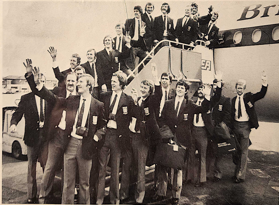
AIRPORT DEPARTURE OF ENGLAND'S TEAM for the 1974 Melbourne World Championships.