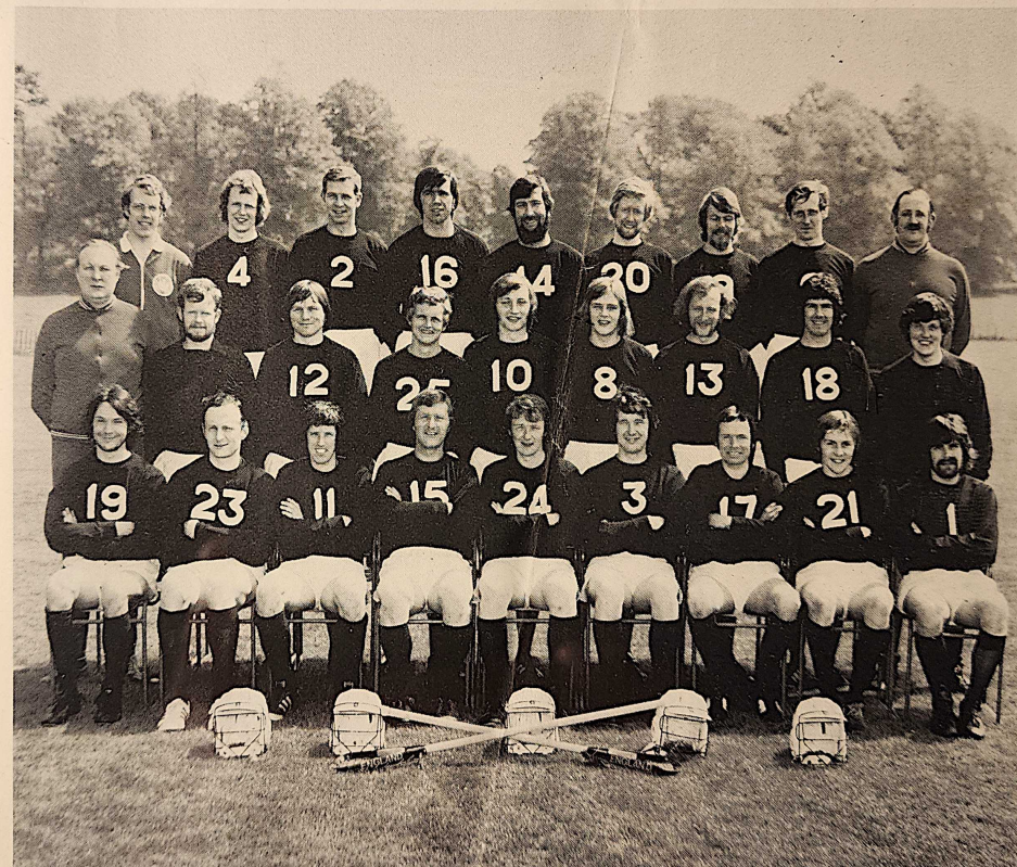
ENGLAND'S 1974 WORLD CHAMPIONSHIP TEAM FOR MELBOURNE, AUSTRALIA

The above Championships are scheduled to be contested here in Greater Manchester in 1978 between the four major lacrosse nations: AMERICA (holders), AUSTRALIA, CANADA and ENGLAND.